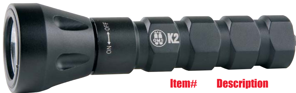
Item# L 192 Description VEGA K2 LED Flashlight