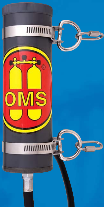
Battery housing for Phantom canister lights