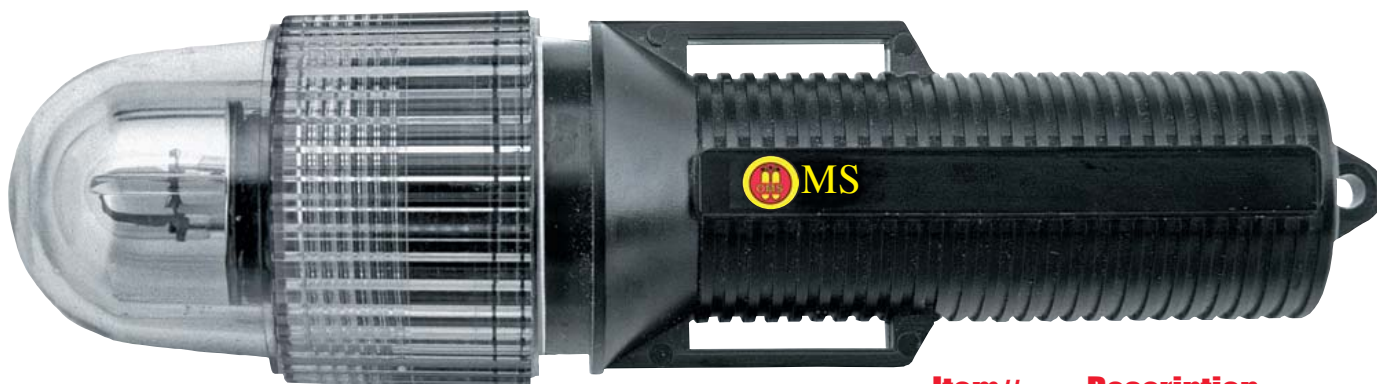
Item# L 198S Description Flash Xenon Strobe with double O-Ring

The Flash Xenon Strobe with updated optics and improved waterproofing design is an essential tool for emergency signaling, anchor marking etc.